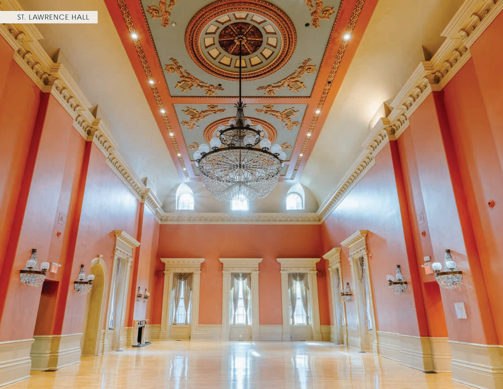
ST. LAWRENCE HALL